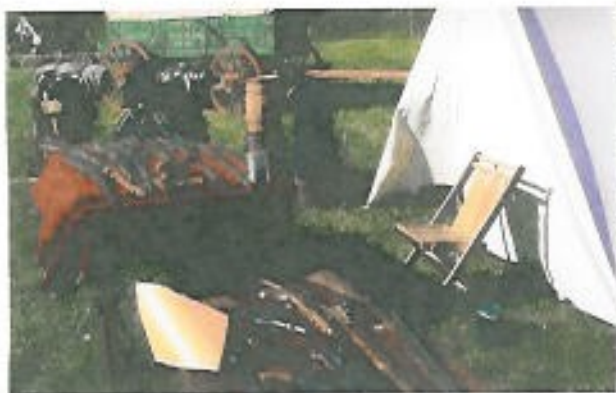
Rusty Carleton's firearm display