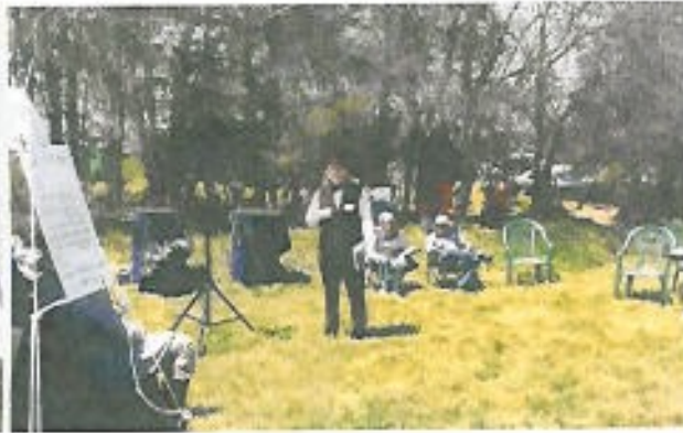
Judge Logan relates the Mountain Meadows story