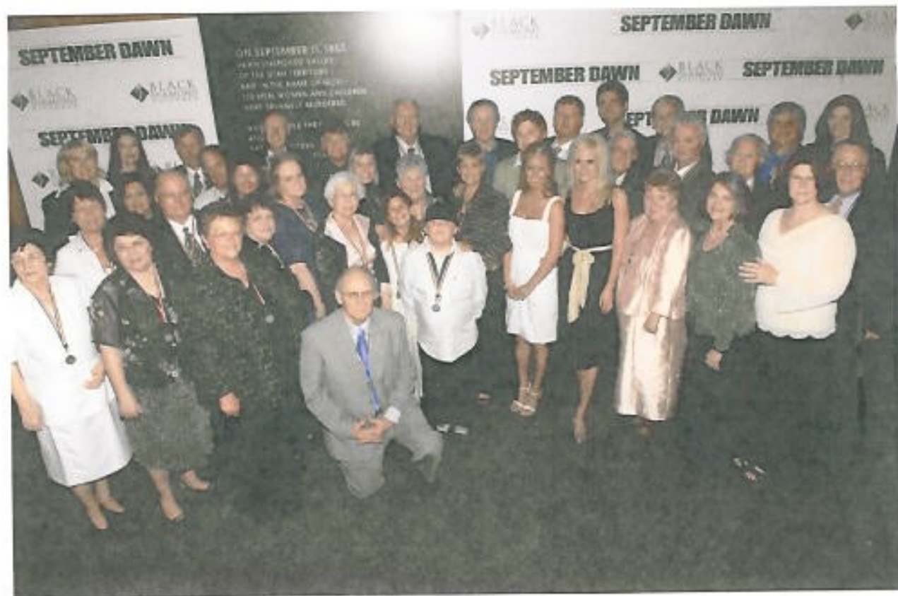
Wagon train descendants (direct and collateral) pose with actor Jon Voight at premiere of September Dawn