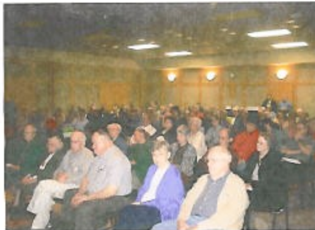
Over 170 people listened to the Power Point presentation on Mountain Meadows