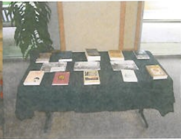
One of the 14 tables of books in the MMMF collection at the Butler Center