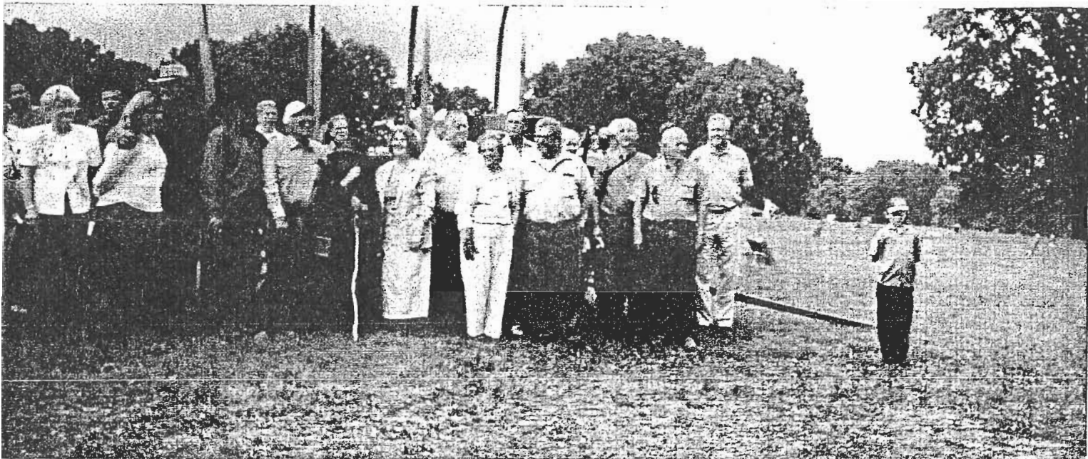
"The Family", Carrollton Lodge, September 25, 2005